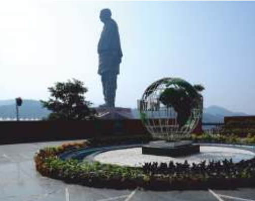
STATUE OF UNITY