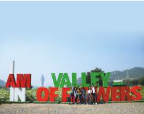
VALLEY OF FLOWERS