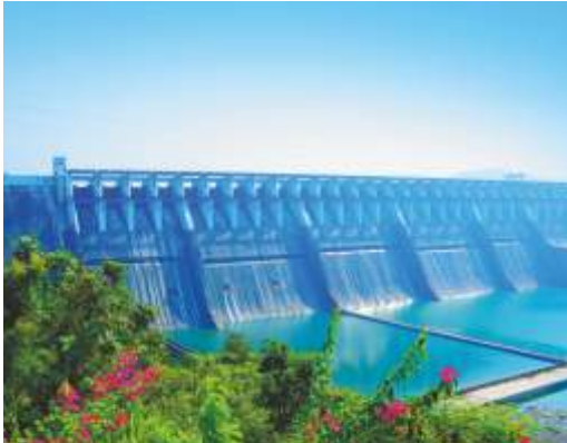
DAM VIEW POINT